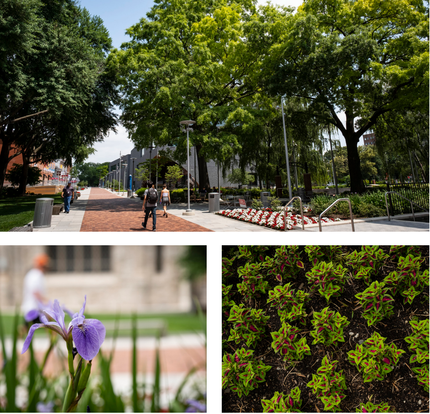
Temple University's uses ILM plant selection techniques for everything it grows, from the tallest trees to the smallest flowers.