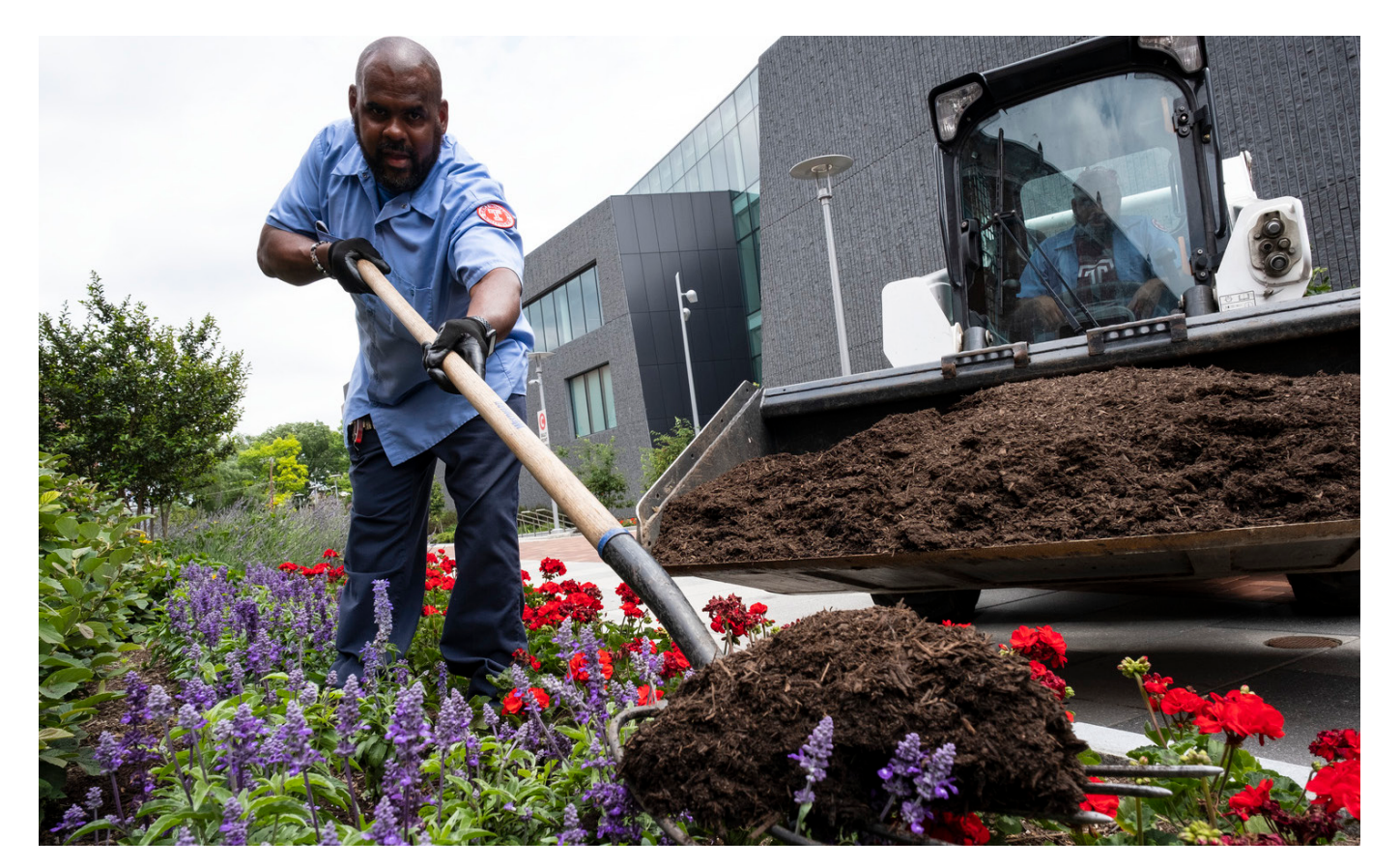
Temple grounds apply mulch to freshly planted flowers to minimize weeds, hold moisture, and ensure plant well-being.

Traditional mulch is a composite of tree bark, wood chips, grass clippings, and other organic material. It is placed on the top layer of soil to lock in moisture and nutrients and to block growing weeds, resulting in an overall improvement to the soil quality of the area. Aesthetically, it also provides an appealing and cohesive look to the gardens it is used in.