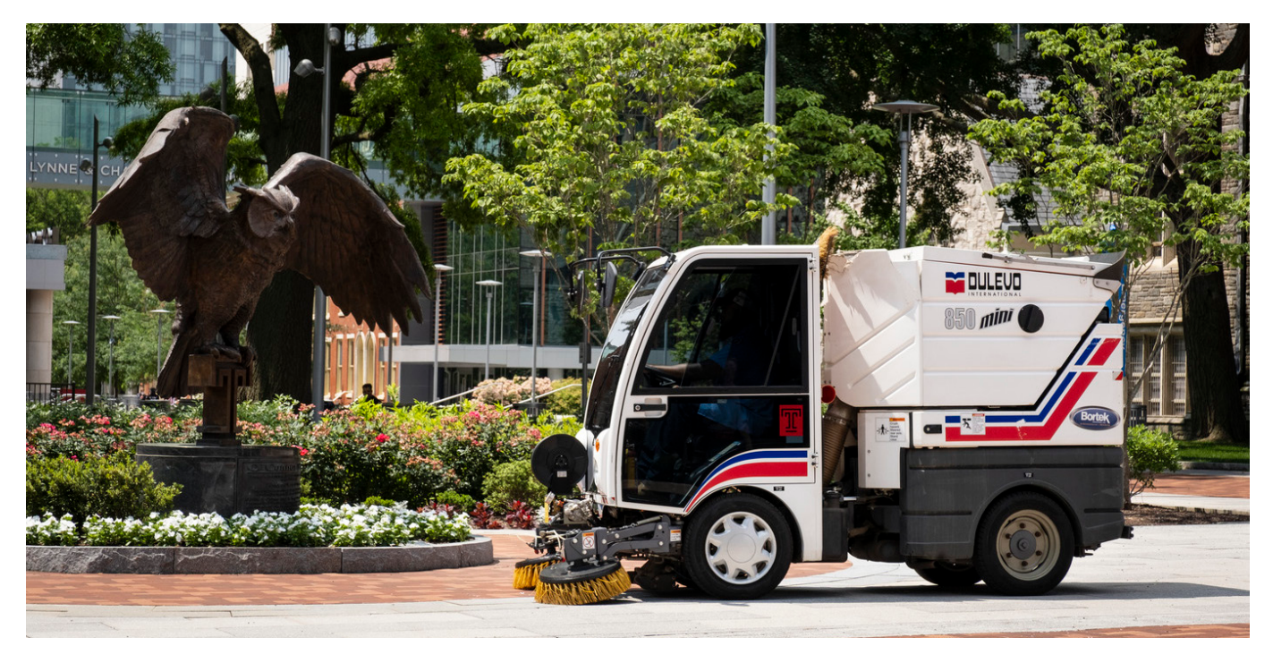
Street sweepers are budgeted on campus to smooth gravel, remove debris from pathways, and keep campuses clean.

ILM also considers the effects that mechanical labor has on the environment and attempts to limit gasoline and electrical inputs on the landscape.