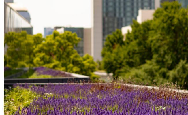
This green roof is located on top of the Architecture Building on Temple's Main Campus and boasts a range of wildflowers and grasses.