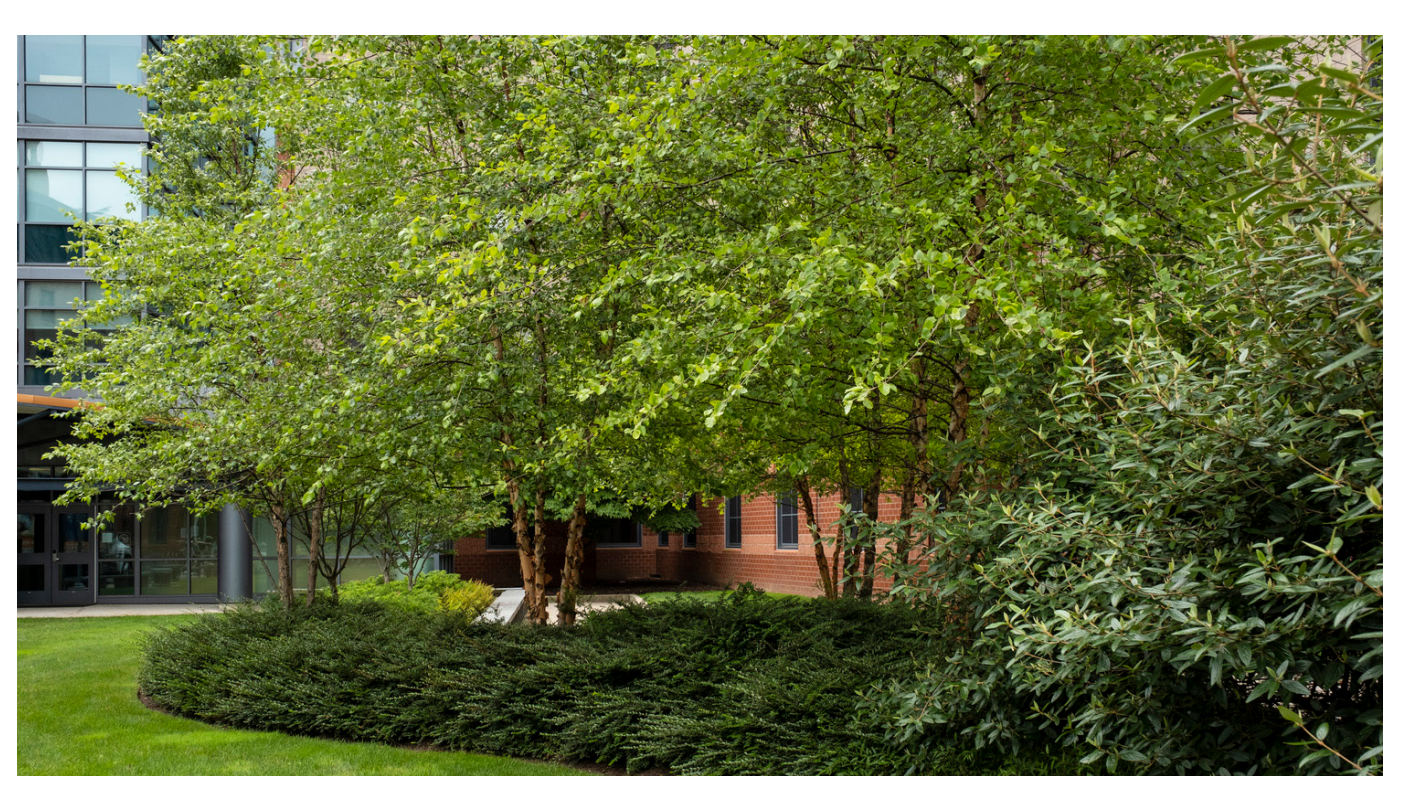
Through trial and error, the Grounds Department discovers the native river birch (Betula nigra) is a tree species that grows well on their urban campuses.

Although the university strives to use native species, it does also use non-native, non-invasive species when it sees fit. When making these decisions in plant selection, the Grounds Department considers the ability of the species to grow with little to no attention after the first two years. For example, many native shrubs require significant watering to remain in good health, while some plants like the Star Magnolia rely on insecticide to survive. Both requirements are labor intensive and costintensive, so they are not planted on any campus. On the other hand, many native trees and plants can withstand urban environments with little attention. The Grounds