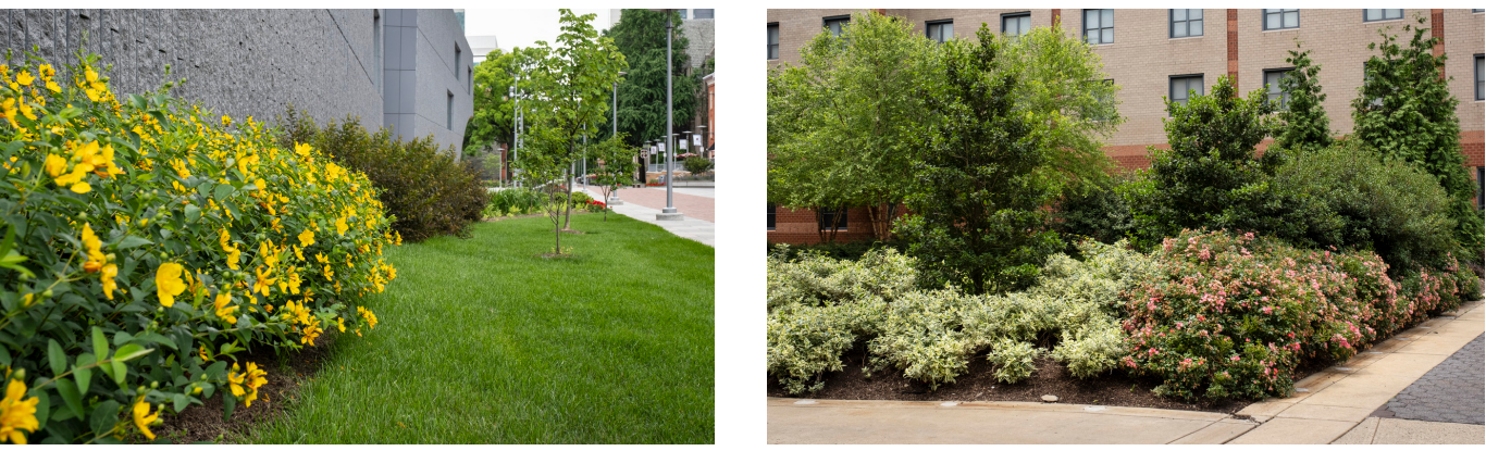
With the range of species planted across all campuses, many environments are created to attract a range of wildlife including songbirds, butterflies, bees and other pollinators.

Plant selection for Main Campus and the Health Sciences Campus is heavily influenced by a plant's ability to flourish in an urban environment. Ambler Campus, meanwhile, provides different challenges as a rural campus. For example, the size of Ambler Campus makes removing invasive species a more challenging, long-term effort.