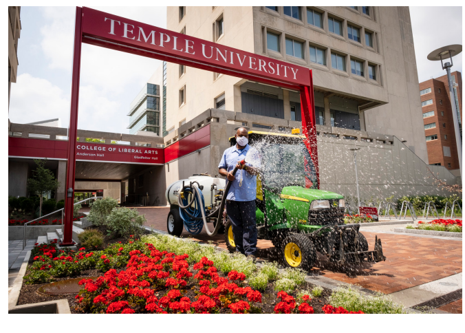
The grounds crew utilizing spot watering to help new plantings establish themselves.

Runoff poses more threats than simply overflowing the combined sewer system; it also poses a danger to growing plants in an already variable, urban environment. With particles of oil, pesticides, bacteria,