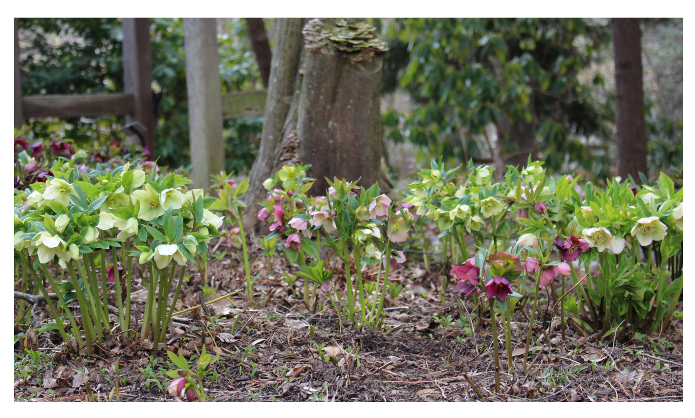
Students in the Landscape Architecture and Horticulture program designed the Ground Cover Garden at Ambler Campus. The garden demonstrates how "green mulch" helps keep moisture in and weeds out of gardens.

The Temple University Grounds Department strives to create and maintain clean, safe, aesthetically pleasing, and sustainable external environments across all the university's campuses. This document hopes to catalogue