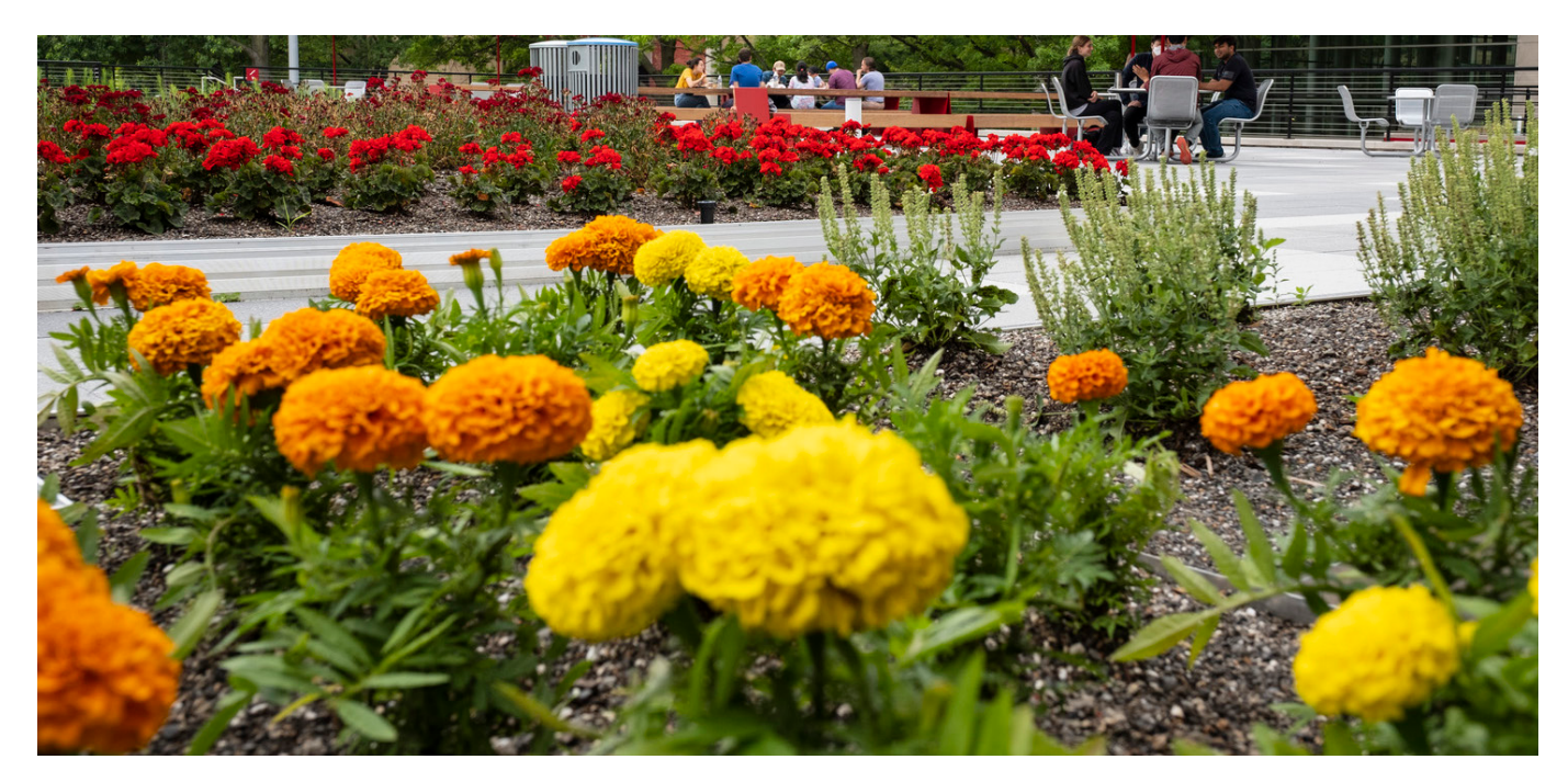
Mazur Terrace provides an open lawn space with plentiful planting beds that are used for seasonal interest flowers that allow pollinators to thrive year-round.

avoided. Another key factor is the plants' effect on area wildlife, particularly pollinators. At Ambler Campus, there is a strong push for flowering trees and shrubs to attract pollinators, which would allow both plant and pollinator to flourish and reproduce.