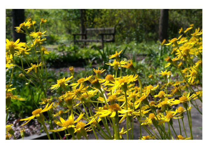
Golden ragwort (Packera aurea) native to Pennsylvania, can be found in Ambler Campus' Formal Native Plant Garden.

Native species are any species that originated in the area that they currently occupy. Temple University made it a goal to promote the growth of native plants whenever possible. On Main Campus and the Health Sciences Campus, the Grounds Department uses knowledge of plants' tolerance of urban conditions to inform their planting plans. For example, through practice, the department has determined that it can rely on River Birch and Sycamore to grow across campus. While native species are a significant focus, their use is not always possible due to their decreased resilience in the city's complex urban environment. On the less harsh, suburban environment of Ambler Campus, a broader