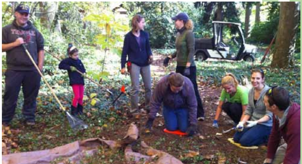
[Left to Right] The winning design from GAID's Energy Conservation Campaign's poster competition; The Classics Department helps remove invasive English ivy in Temple University Ambler's Woodland Garden.