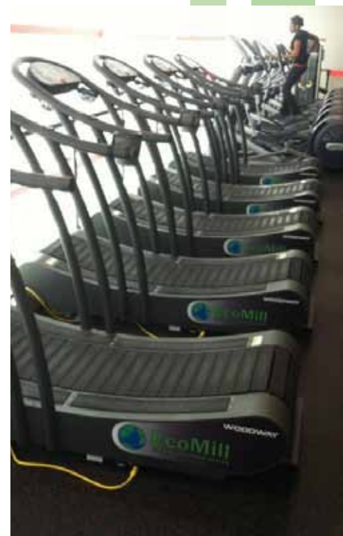
[Left to Right] Clayton Blunk is conducting an energy audit at the Bio-Life Building as part of Temple's Energy Conservation Campaign; One of four solar-powered tables installed on campus before the start of the fall semester; Cardio equipment at the Pearson-McGonigle Hall fitness center creates energy from use.