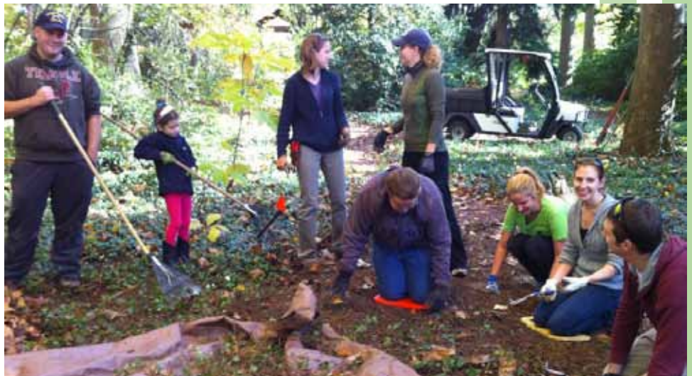
[Left to Right] The winning design from GAID's Energy Conservation Campaign's poster competition; The Classics Department helps remove invasive English ivy in Temple University Ambler's Woodland Garden.