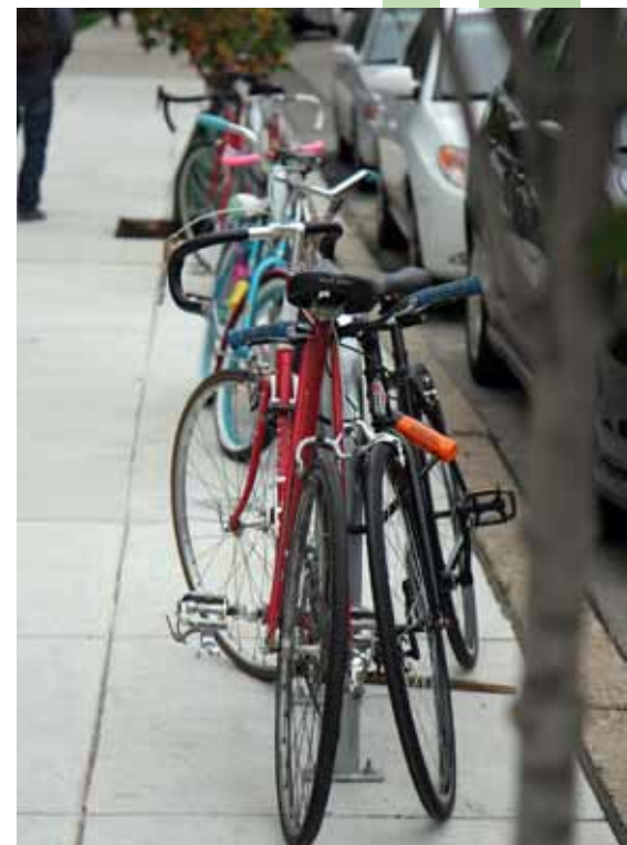
[Left to Right] Hooter shows off the hybrid-electric vehicle at J&H; Temple provides bike racks to meet the needs of the cycling community.