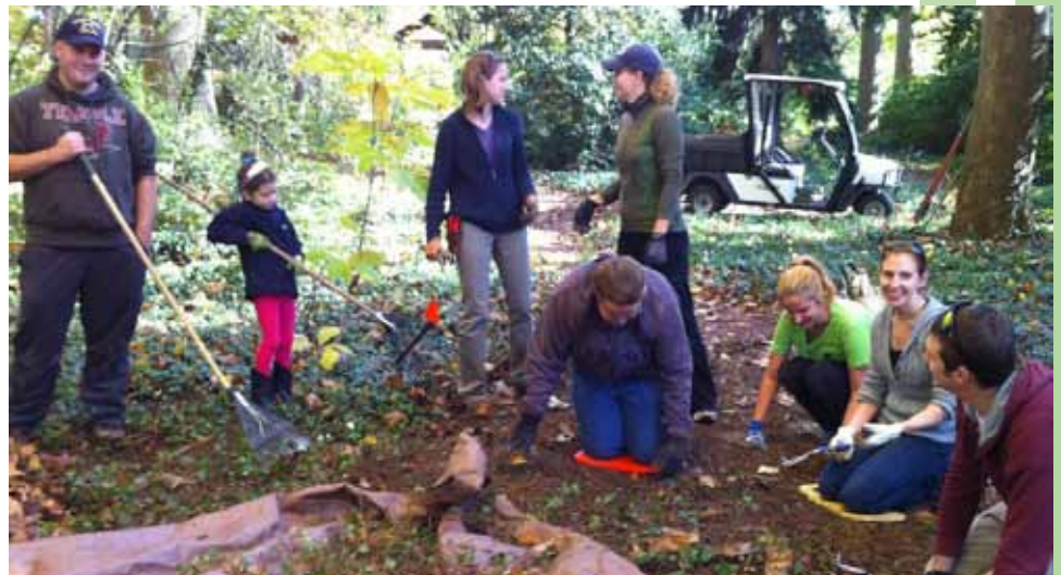
[Left to Right] The winning design from GAID's Energy Conservation Campaign's poster competition; The Classics Department helps remove invasive English ivy in Temple University Ambler's Woodland Garden.